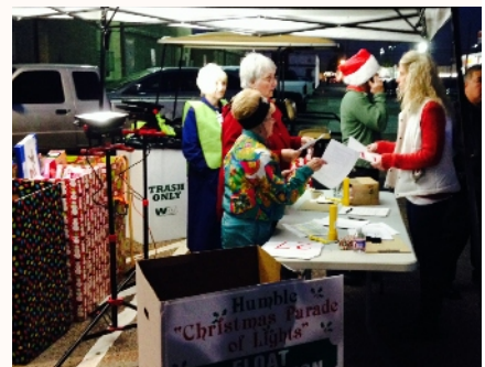
Humble volunteers working with Humble PD officers on the parade information.