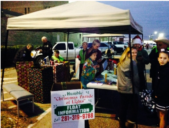
Final parade line up adjustments.