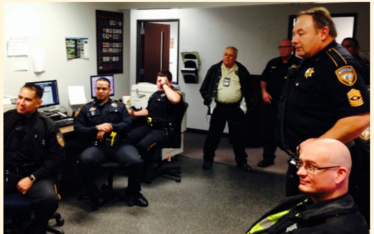
District 2 HCSO deputies and alumni at the presentation.