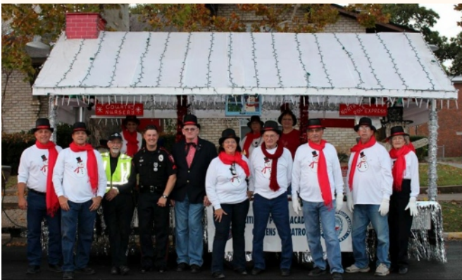
Most of the hard working float crew was represented above and marched in this years parade. Again, a BIG THANKS to all that gave up their time and talents to ensure another Award Winning Entry.