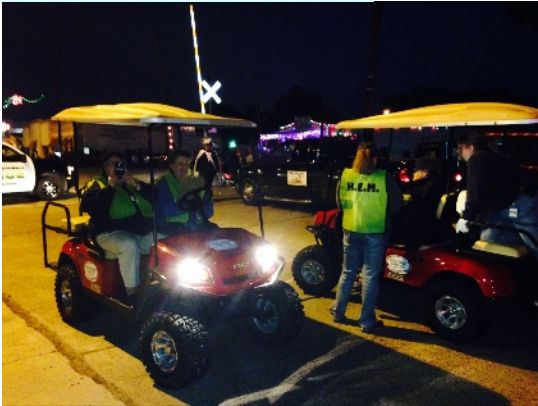
Volunteers finalizing parade line up.