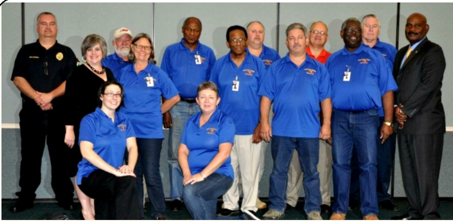
Our 29 th CPA Class graduation