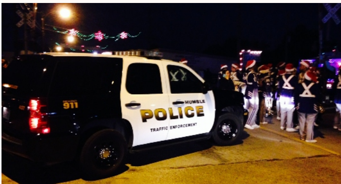
Humble PD new Tahoe starting the annual Christmas Parade. This was the biggest one to date!