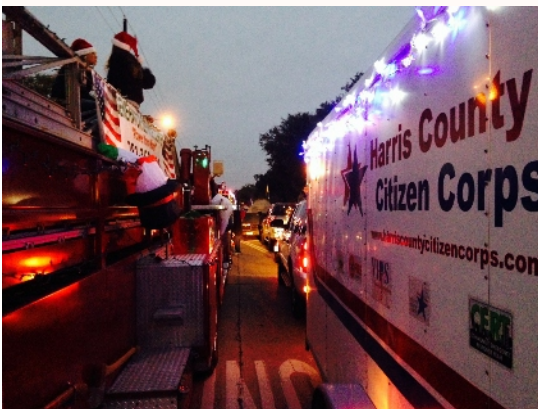
...and the parade is off and running!