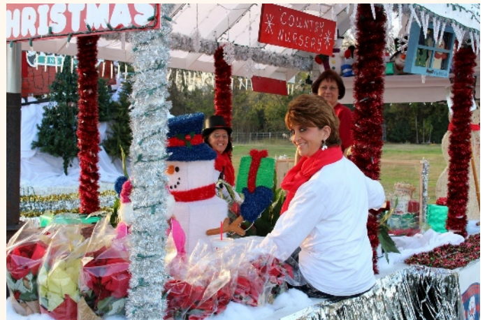
A number of photos from Brenham of their parade float. (No captions were provided.)