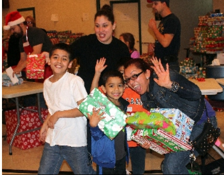
Everyone leaves with a smile on their face and a gift in hand!

In all, we collected well over 2500 toys for those less fortunate in La Porte, Morgan's Point and Shore Acres. While 650+ children were able to receive a toy and visit with Blue Santa on Saturday, many more toys and food were distributed the following week to local churches and other organizations. La Porte was truly blessed this year. Oh, and