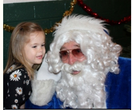
Someone had a special wish for Santa. Luckily, the Elf Team had just the right Barbie!!

Officers and the C.O.P. team have already utilized two of the big boxes to help comfort children caught up in domestic issues or simply for community goodwill. In one case, a child was inadvertently locked in the car and the C.O.P. team dropped