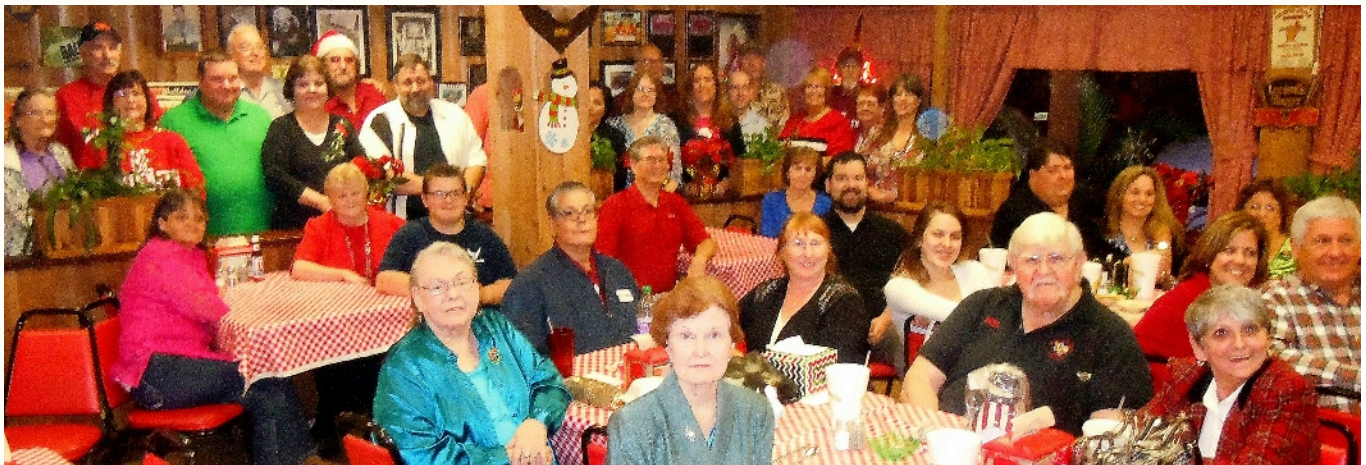
ANNUAL AWARDS BANQUET – LPCPAAA Members & Guests