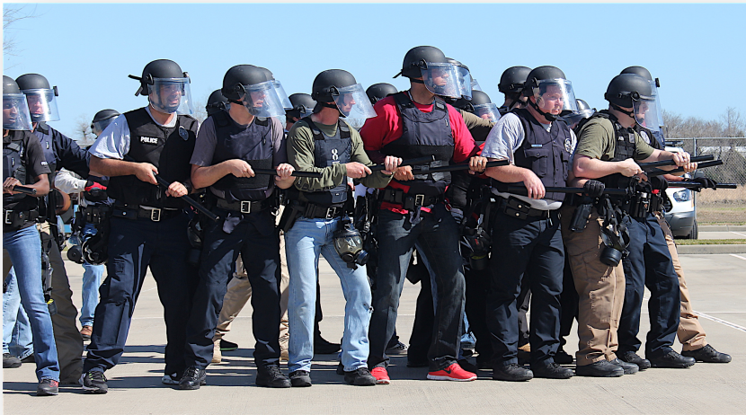
Officers are ready and in formation to control the crowd.