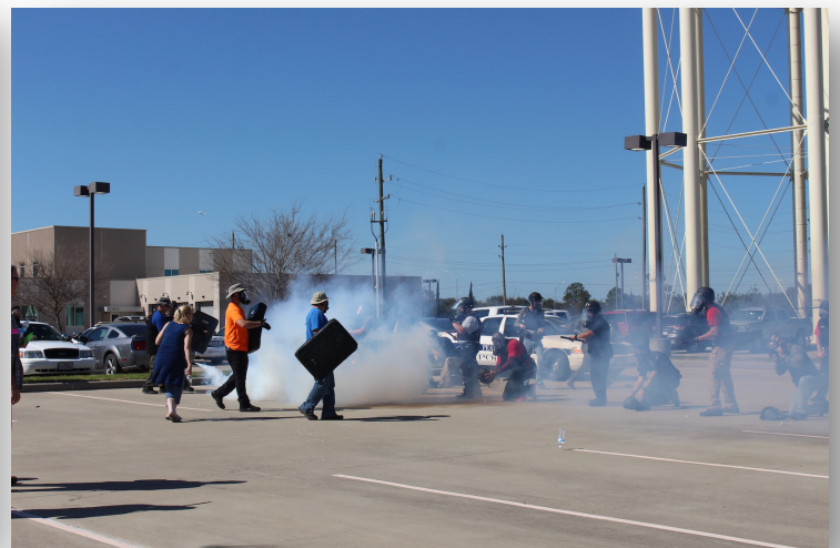
Things got a little gassy.