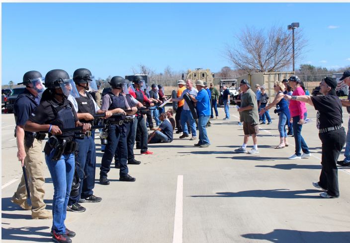
The police face a rowdy crowd.