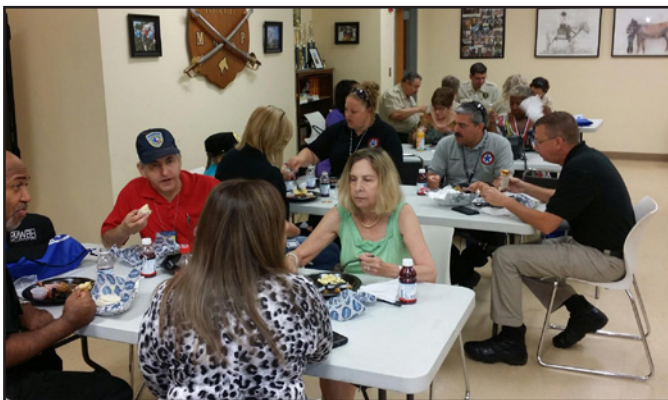
Brunch - Volunteers from Houston, League City, and Harris County Sheriff's CPA's enjoying brunch