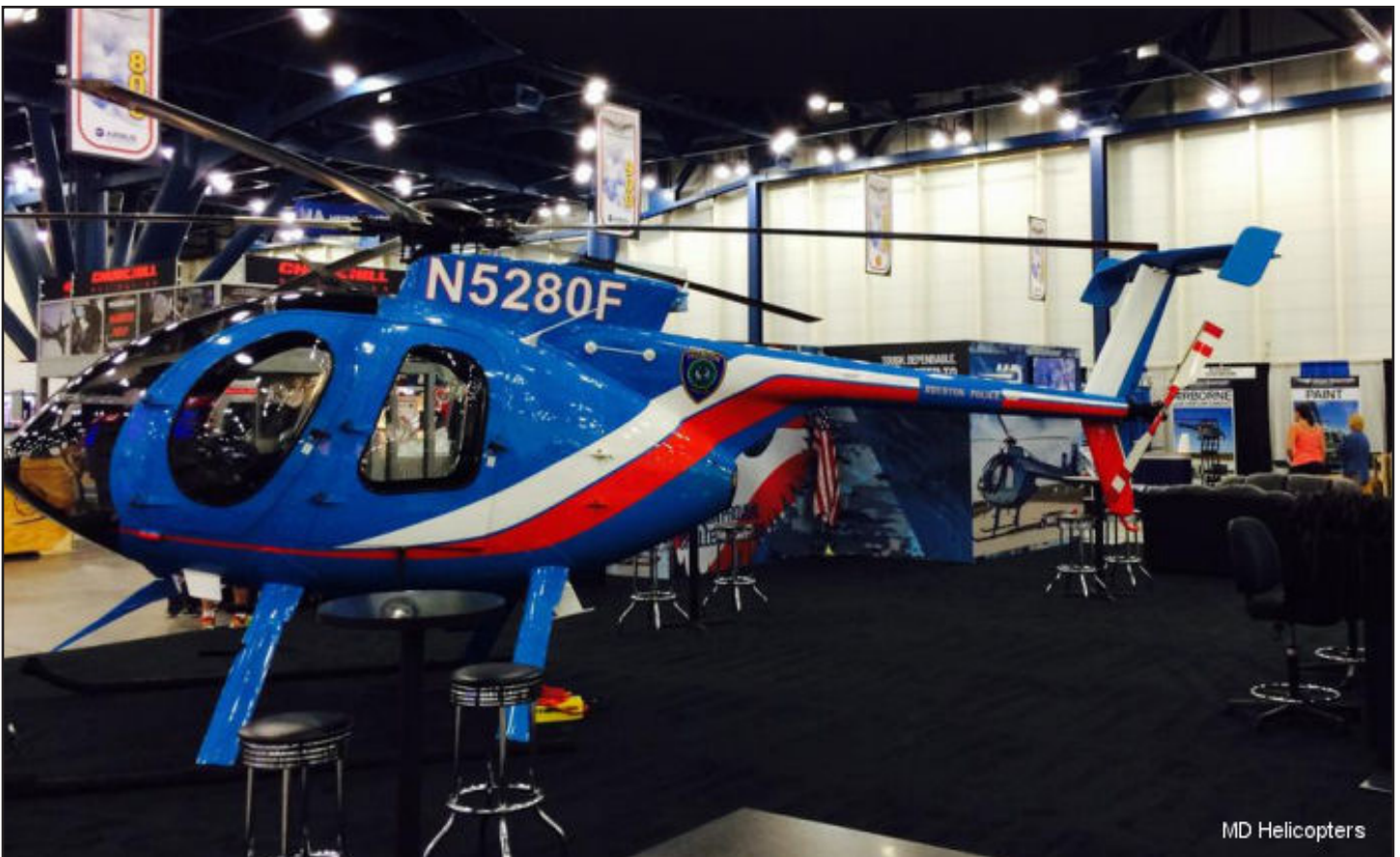
Houston Police Department MD 500E Helicopter