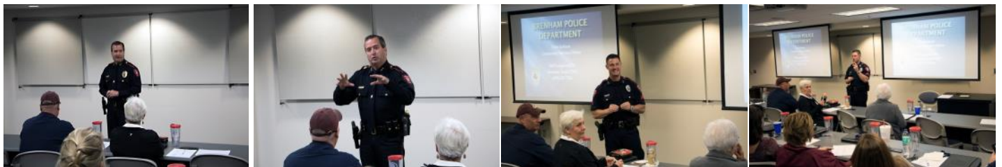
4. The Chief continues and then decides to choke the stunned student!!