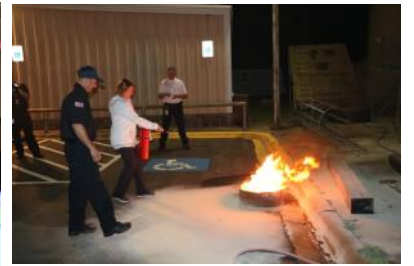
Playing with FIRE and winning!!