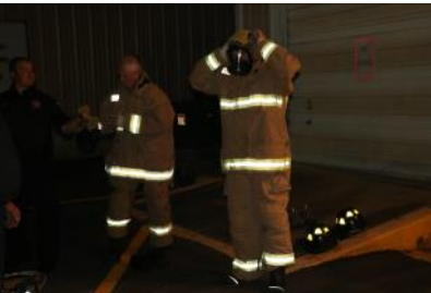
BFD Tour 2-23-17