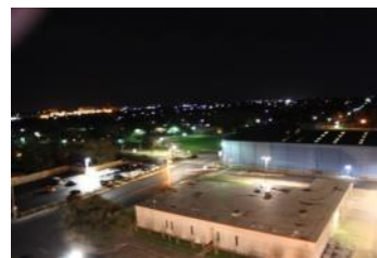
Great View, right!