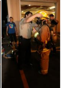
Who said, one size fits all??