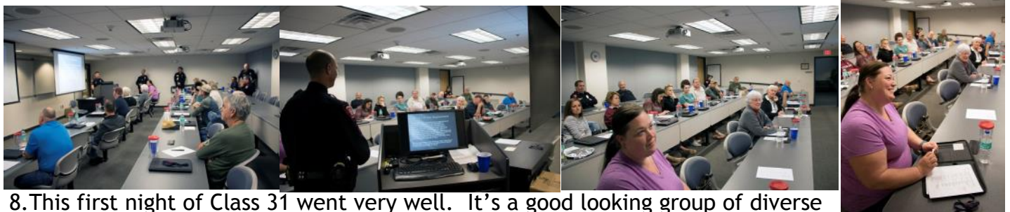
8. This first night of Class 31 went very well. It's a good looking group of diverse individuals including the Chief's wife and some of her friends (teachers from Alton Elementary). I hope they soaked in some of that information, because a lot was disseminated. And some jokes and funny stories were told as well.