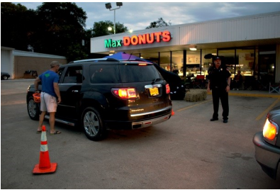
Below: The food line; YUM!