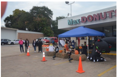
Our Witch riding her broom!