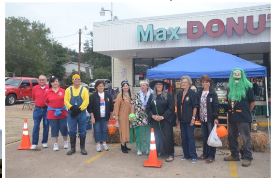
Above: Most of our Crew for the evening. What a great group!!