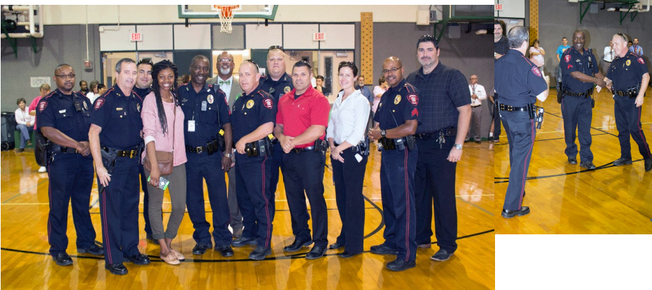
Below: The BPD gang!